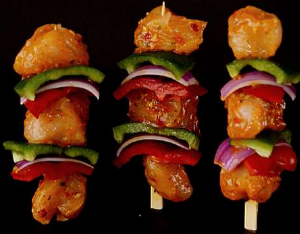
chicken & vegetable kebabs