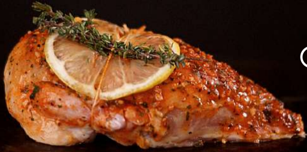
lemon & garlic chicken roaster